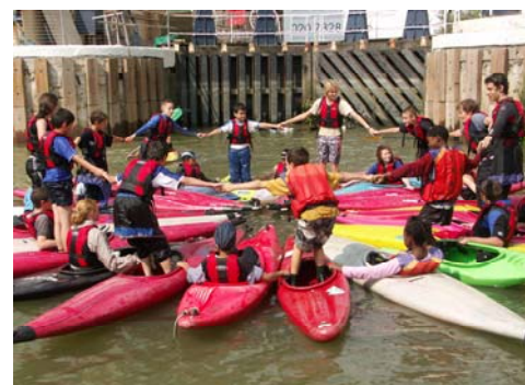
WBB kayakers playing raft games in Grosvenor Dock last summer

As you are reading this, we are busily preparing and publishing our programme. When finished, it will be available as a paper copy, as a download on the website and via email - so refresh your browser, watch your inbox and listen for the sound of the postman as you could be in for a treat!